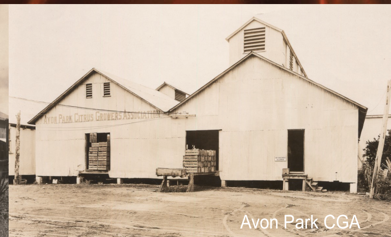
Avon Park CGA