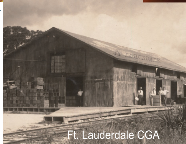
Ft. Lauderdale CGA

Donate them to the Florida Citrus Archives so they'll be preserved and become a part of our citrus heritage!