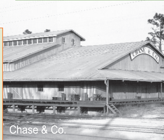
Chase & Co.